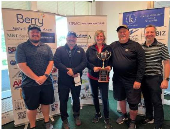
Aircon Engineering First Place Gross