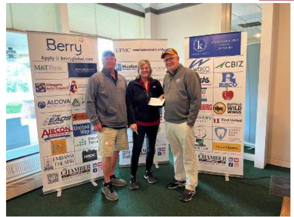
Egle Nursing & Rehab First Place Net